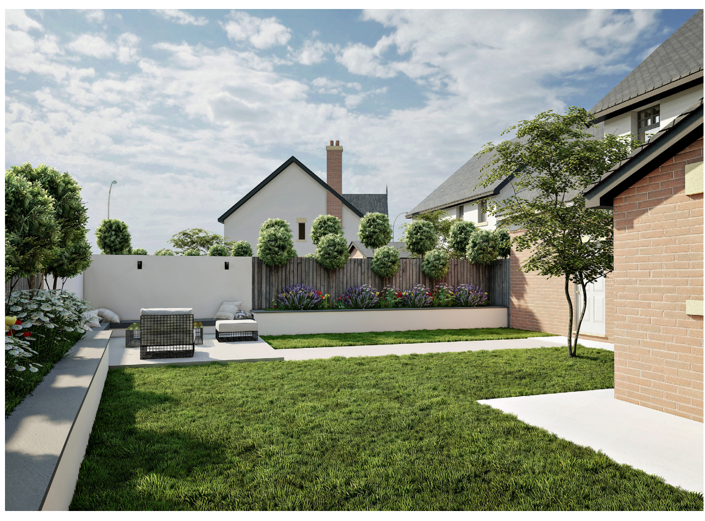
All images are for Illustration purposes