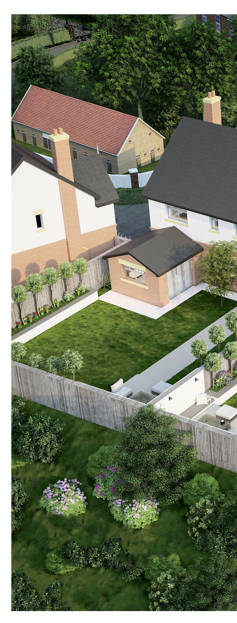
All images are for Illustration purposes

When this is done, the house belongs to you and you can move in on the agreed date. This is called 'completion' and our sales representative will arrange a full handover and you will receive the keys to your new home.